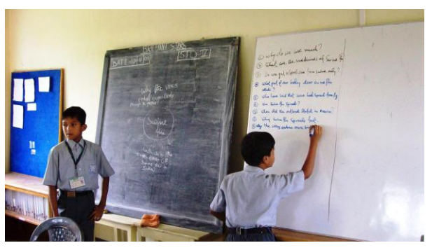
Consolidating questions into a final list

Each and every question suggested was recorded, after which a process of consolidation took place - students helped to remove irrelevant questions and merge similar ones in order to create a more concise final list of questions to investigate and research.