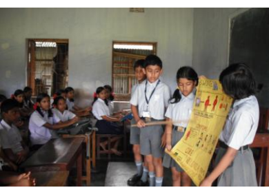
Visit to Palatana School

Brilliant Stars English Medium School, Udaipur, Tripura – 799114, http://brilliantstarsschool.org