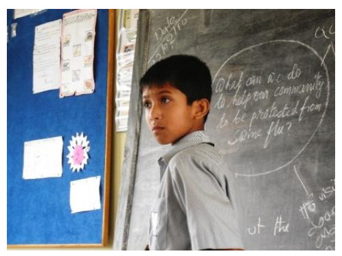
Discussion on 'what can we do to protect our community from swine flu'

With the help of a brainstorming session on the possible ways to protect their community from Swine Flu, the students concluded that spreading awareness on the symptoms, prevention and cures of Swine Flu would be the best course of action.