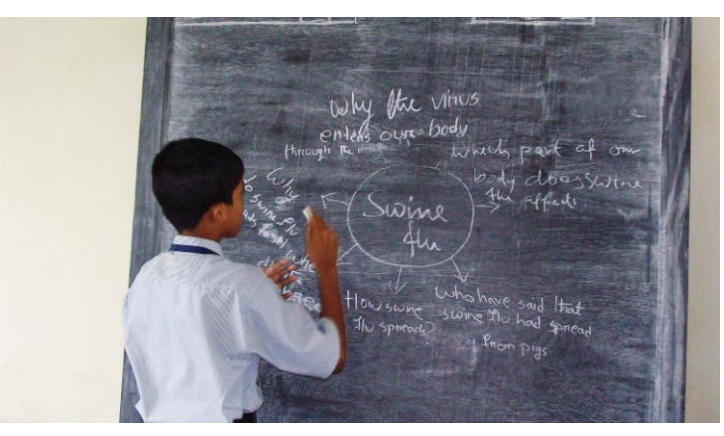
What we already know about Swine Flu (concept web by one group of students)

Having established what they already knew, the students could now think about what more they needed to know in order to work on the problem. A brainstorming session was conducted in a large group setting where students were encouraged to keep throwing out any and all questions that came to mind on Swine Flu while it was being recorded on a concept web on the class blackboard. During this exercise, students were encouraged to frame their questions with grammatical accuracy. The teacher, noticing a teaching opportunity, used it to help students with their sentence phrasing, especially interrogative sentence phrasing (a concept being taught in English Grammar class). In addition to the phrasing, students were asked to pose relevant, specific and clearly presented questions.