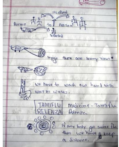
Notes taken by one group during the Swine Flu video