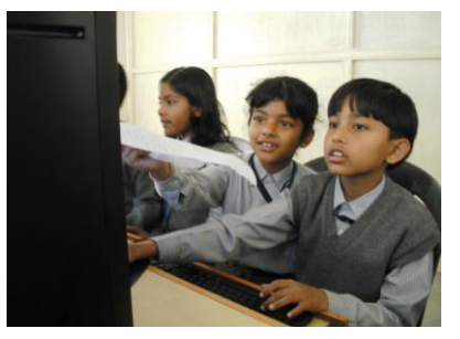
Surfing the internet in pairs

Observations and Reflection: The Central Education Board syllabus does not include surfing the internet at such low grade levels, however, our students learned the basics in browsing the internet through this project. They also understood how useful the internet is as a tool in gathering and sharing information.