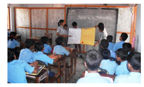
Presentation to students at one of the first two schools

Observations and Reflection: The students had shown remarkable improvement over past projects, in their skill of designing visual aids for presentations. Their 'Swine Flu' charts were much more legible and their ideas were more logically organized on it.