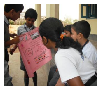
Mock presentation to aroup members

The students identified a few schools in the Udaipur town that they would visit. A strategy was developed to first visit only two schools in order to use the feedback from them to enhance their presentations, before then approaching a larger set of schools. Students began preparing visual aids and even made mock presentations to their group members for practice.